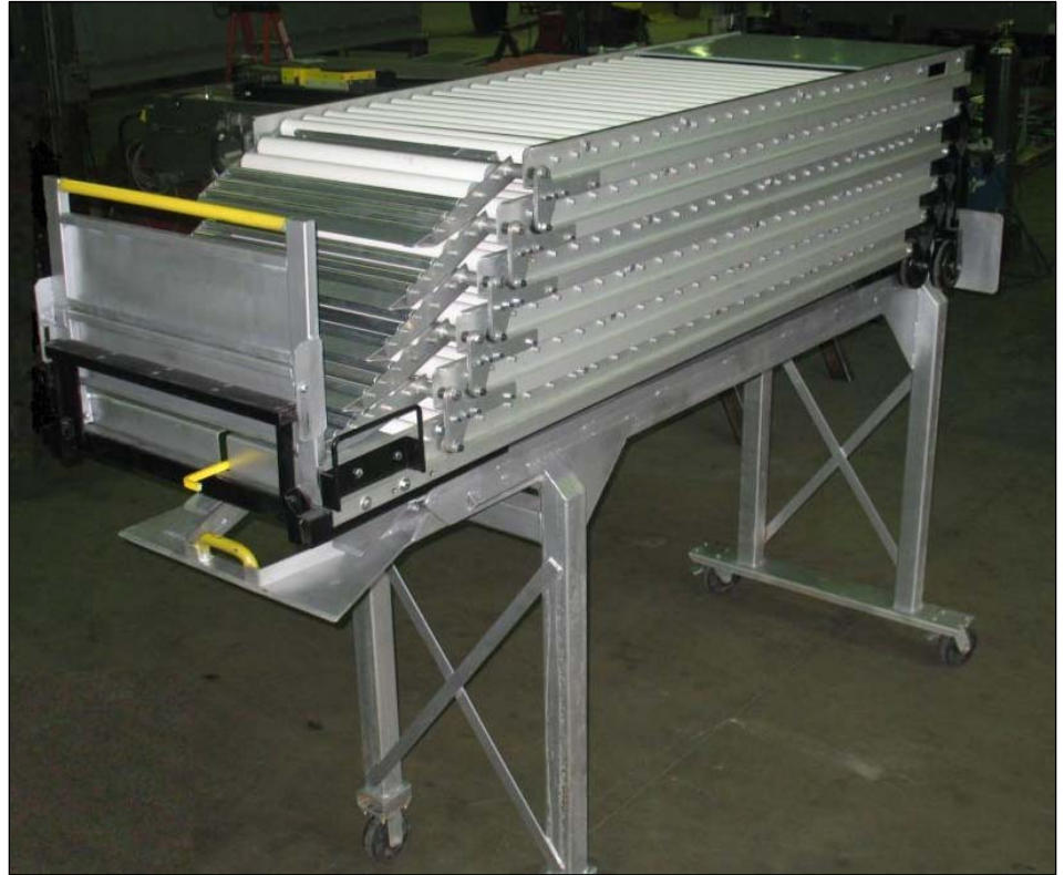
Model 9071 - Shown with elevated docking station.